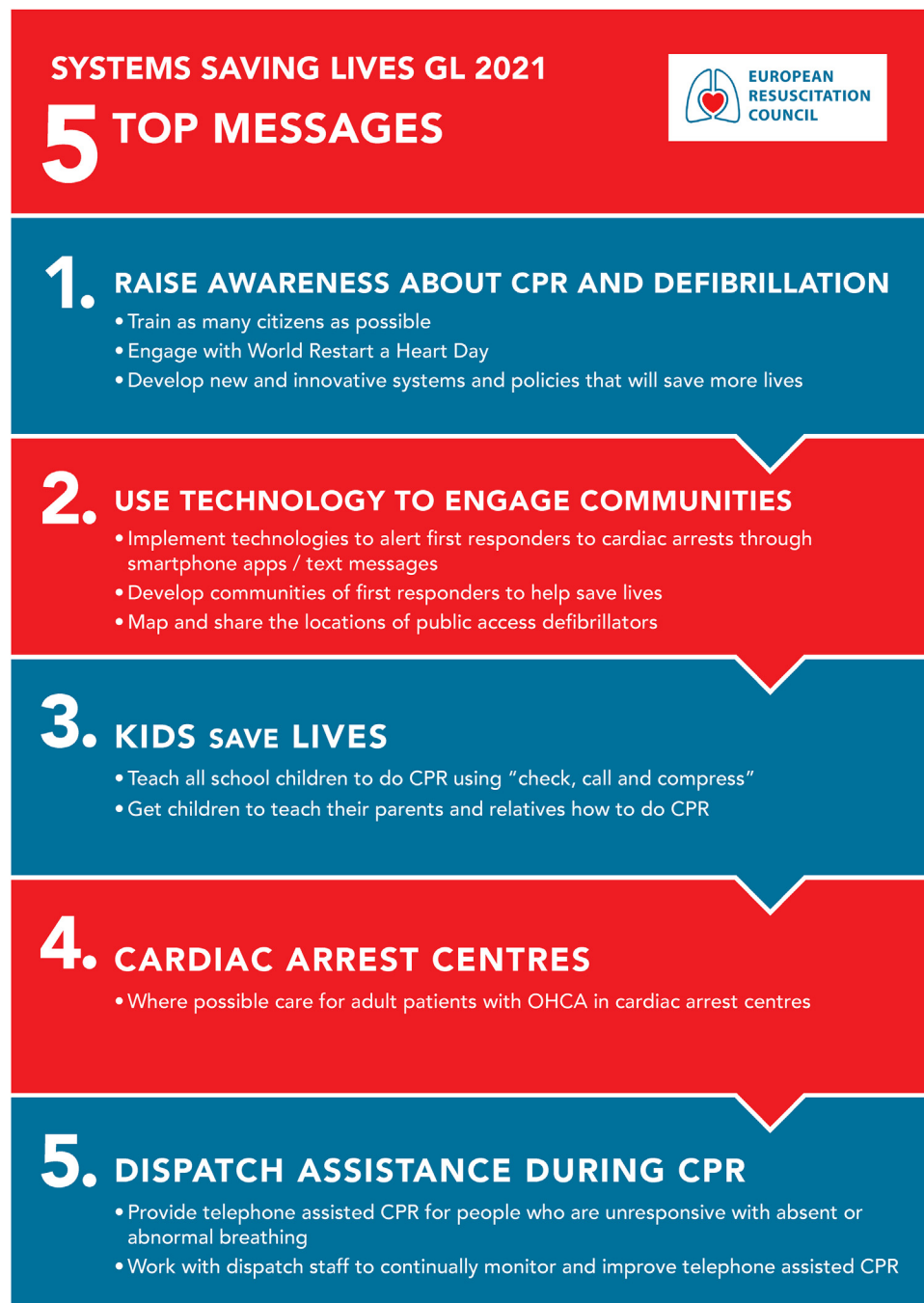
Fig. 1 – System saving lives infographic summary.

In the past, the guidelines of the ERC have been developed from a perspective of an ideal high-resource or high-income environment. Little attention has been paid to the applicability of statements from such areas in the daily practice of lower-income regions. In many parts of the world, a high-resource standard of care is not available due to a lack of financial resources. For example, low-quality performance of EMS can be a barrier